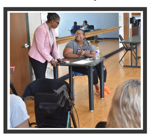
Rep. Shephard checks in with volunteer

The turnout was impressive – 60 registered in advance and more than 40 attended.