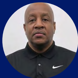
Assitant Athletic Director/ Men's Head Basketball Coach