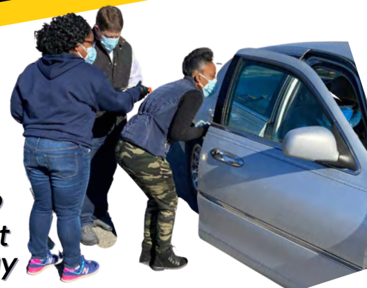
COVID 19 Home Test Give Away