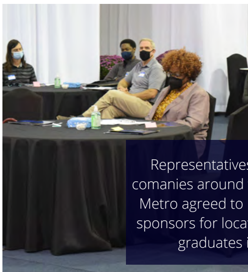
Representatives of various companies around the Little Rock Metro agreed to be corporate sponsors for locations to place graduates in jobs.