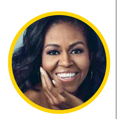
Michelle Obama Former First Lady of the United States